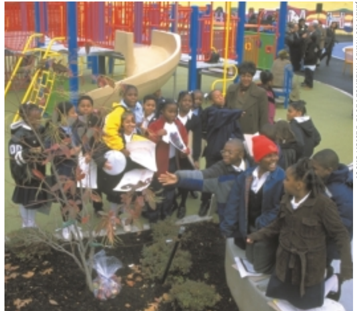
JERRY HOWARD/WALLACE FLOYD DESIGN GROUP

The Initiative takes a broad-based approach to education. It encourages the design of multi-use spaces that lend themselves to instruction in all