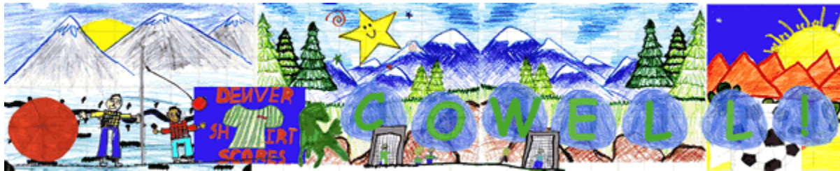
Figure 6. Computer Image of Cowell Denver Scores Mural