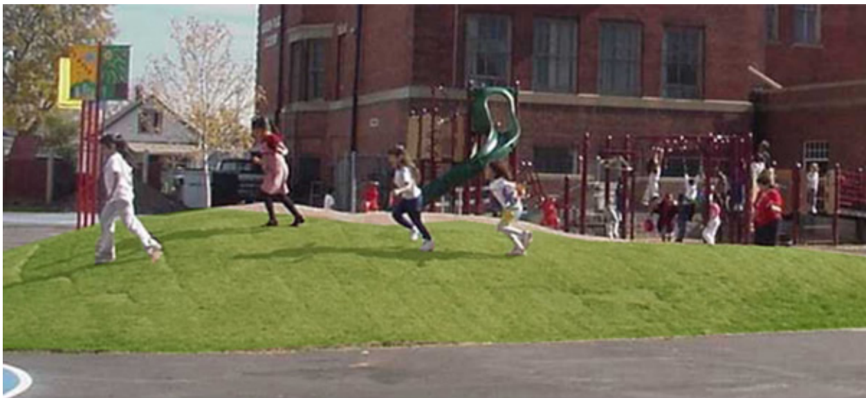
Figure 8. Children Play on Garden Place's Erosion Hill

Recess is quite often the only time a child has total control of his activities at school. Playgrounds offer the optimal environment for children to socialize and learn about conflict resolution. Principals and teachers at Learning Landscapes