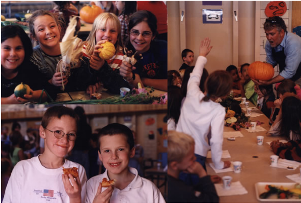
Figure 3. Bromwell Elementary Children at Their Fall Harvest

Approximately 75 percent of the learning landscapes have some type of an ecosystem garden. At Bromwell, where the Parent Teacher Student Association (PTSA) has an active role in the school, there is a tall/mid grass native prairie. Urban environments put an undue amount of stress on the establishment of native grasses in a semi-arid climate. It has taken three years to establish the grassland garden at Bromwell, and the PTSA is currently working jointly with UCD to petition the Environmental Protection Agency (EPA) to allow the school to burn its grassland— a mandatory practice to ensure a healthy prairie in Denver. DPS and the surrounding fire districts have approved the burn; the EPA, however, has denied the permit for air quality reasons.