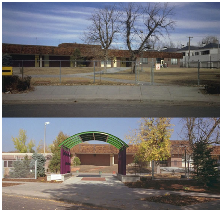
Figure 1. Bromwell Elementary before and after Redesign

The success of the Learning Landscapes project is founded on a healthy enthusiasm for aesthetics, as well as a pragmatic approach to maintenance, safety and recreational issues. The principal value of a learning landscape is its multi-purpose nature. In an era of limited municipal resources and widespread gentrification,