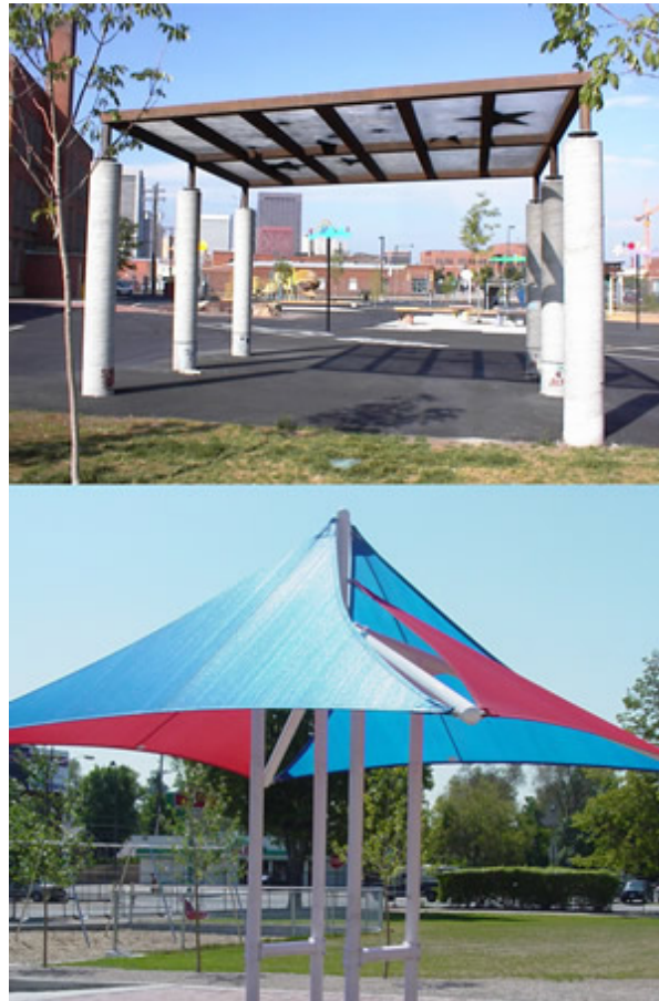
Figure 12. Shade Structures at Colfax and Crofton Elementary Schools

Community surveys validate these findings with a 77-percent agreement that the community has a sense of pride in the playground. Further evidence of community support for the Learning Landscapes project was the allocation of $10 million for completing another 20 learning landscapes as part of a $300 million dollar general obligation bond (GOB) that received overwhelming voter approval in the fall of 2003.