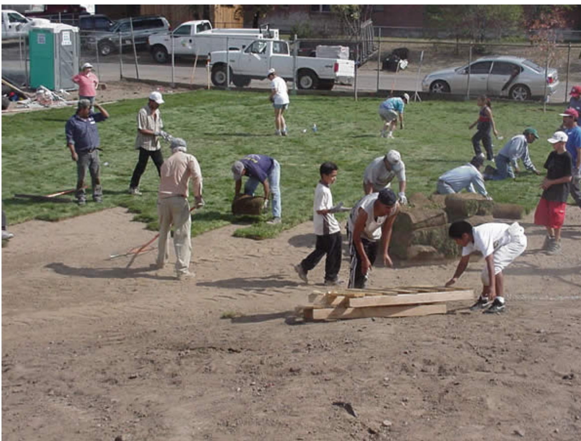
Figure 11. Volunteer Build Laying Sod at Swansea Elementary

Unlike traditional schoolyard designs, learning landscapes are designed as multi-generational places. Social gathering places designed for school children become community spaces during non-school hours and are used extensively on summer evenings. The shade structure/pavilion acts as a community landmark as well as gathering place and typically offers an excellent vantage point for teachers, parents and grandparents alike to observe children.