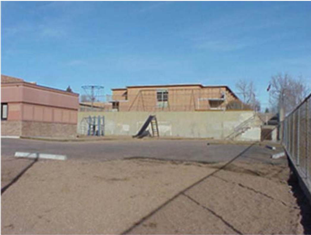
Figure 2. Cowell Elementary Preexisting Condition