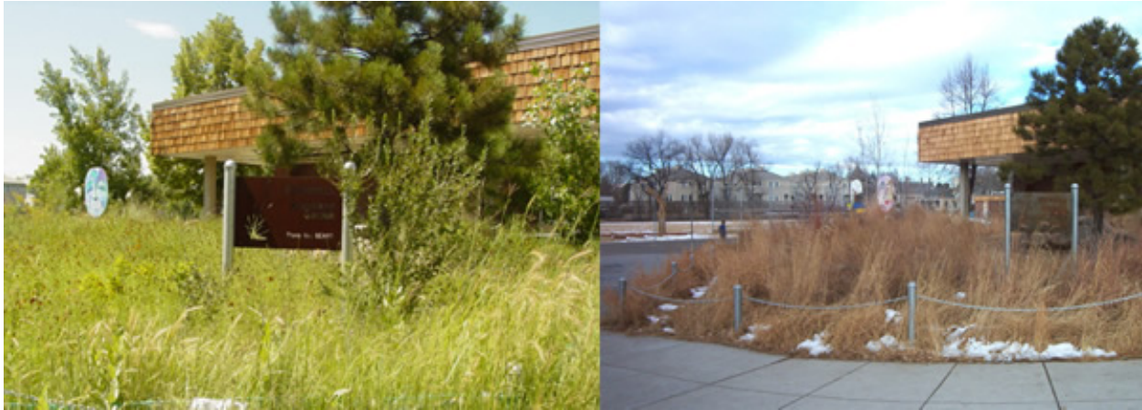
Figure 4. Bromwell Grassland in the Spring

In most cases, the ecosystem garden provides a habitat for urban wildlife. Riparian landscapes offer critical urban wildlife area opportunities while improving drainage on school grounds. The butterfly habitat garden, popular with teachers, provides an ideal setting for science lesson plans. Students can inventory the garden as a butterfly habitat, identify all existing plant species, determine which plants were useful as adult and larvae hosts, learn what butterflies might be attracted to the garden, and decide on features that need to be added to the garden to attract butterflies.