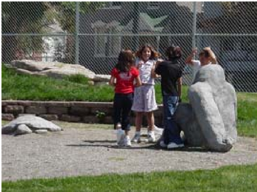
Figure 9. Young Girls Socializing at Greenlee Elementary

In addition, the use of boulders in gardens and throughout the playground has been a positive cost-effective element. Surveys conducted at 40 DPS elementary schools show that boulders are one of the top five preferred playground elements by 90 percent of respondents (Brink et al. 2004). The preferred boulder size is five to seven tons. This allows for two or three children to gather, while still allowing a fourth child to comfortably sit alone and read.