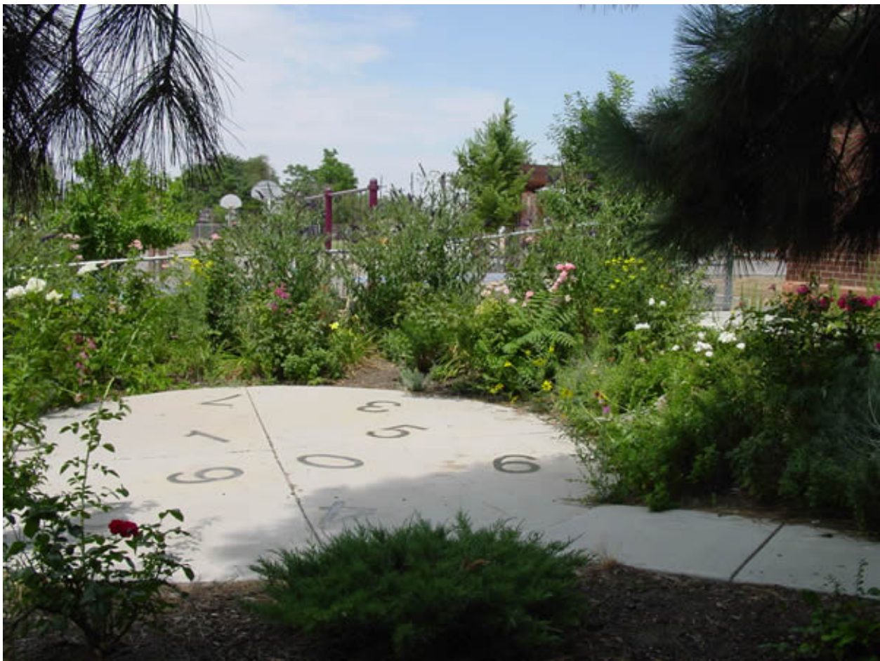
Figure 5. Garden Place Butterfly Garden