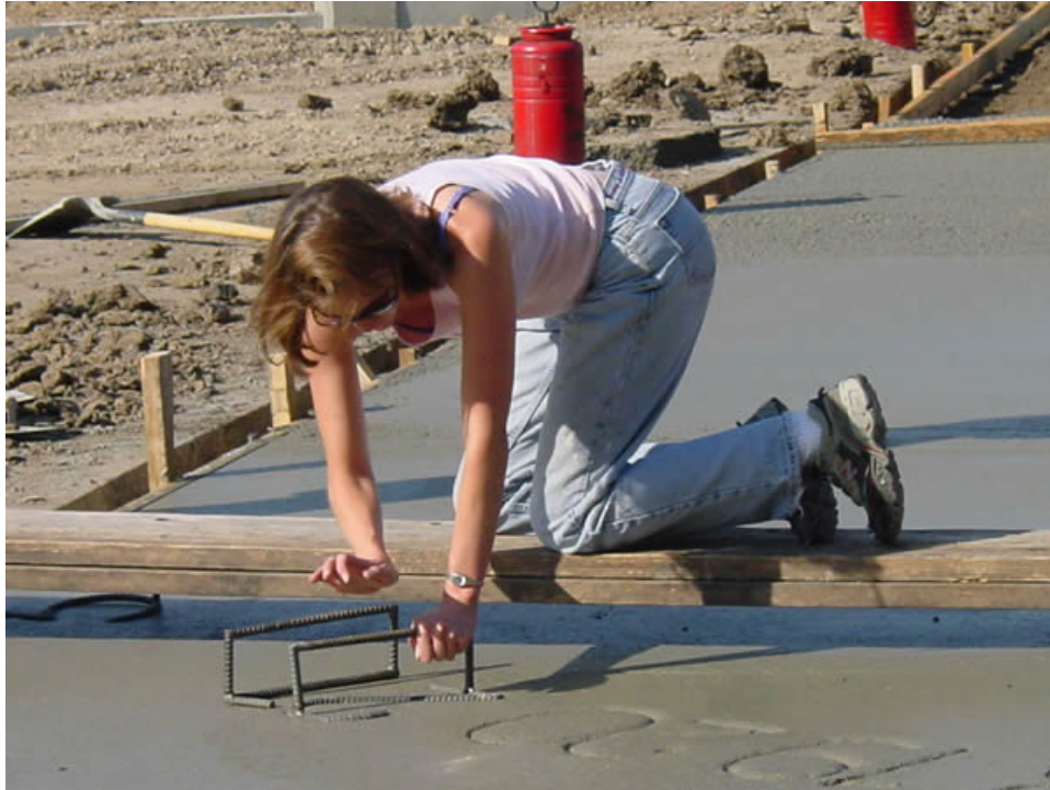
Figure 13. Graduate Student Stamping Numbers in Concrete

As Learning Landscapes continue to be built with GOB funding, UCD will continue to provide design review assistance. The main focus of Professor Brink's research will be the long-term sustainability of these urban landscapes and their integration into the day to day rituals of schools and neighborhoods. Learning landscapes are generally outside the realm of traditional DPS site maintenance. UCD and DPS have entered into a three-year technical assistance program (TAP). This program will work with the site-based facility managers and the children to: