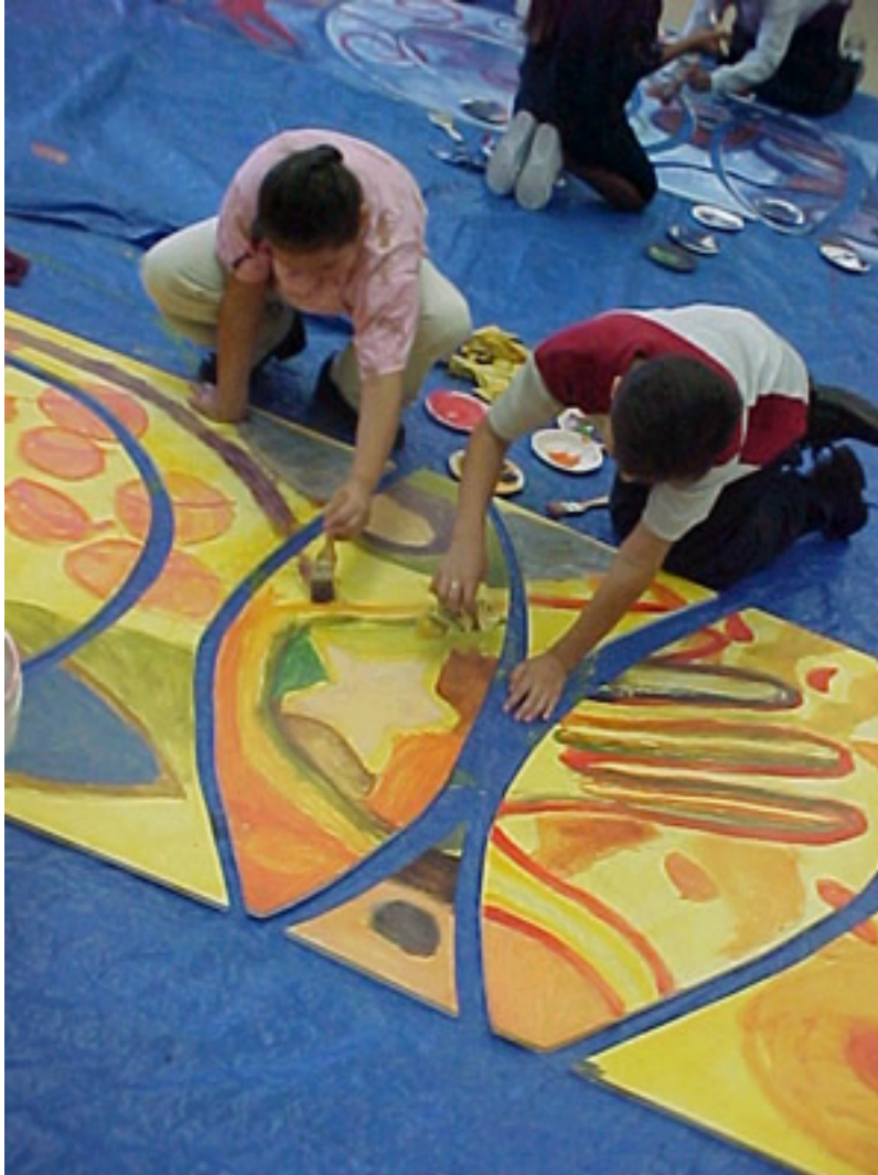
Figure 7. Students from Smith Elementary Painting One of the Murals